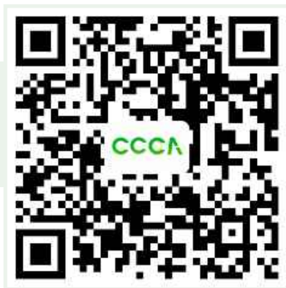
《中国企业气候行动传播视频》 Introduction Video of CCCA