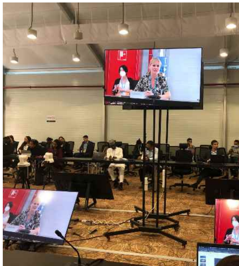
UN直播边会“建设具有韧性的岸线基础设施” Building Resilient Infrastructure along the Coast @ UN Meeting Room