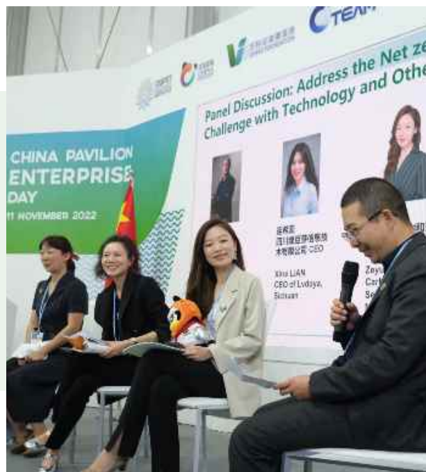
COP27中国企业角边会“云集企业力量，共创零碳未来” Corporate Actions for a Net Zero Future