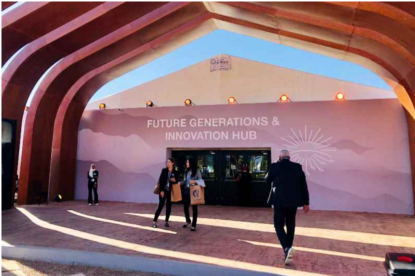
企业展位于COP绿区“未来世代与创新中心”展厅 The CCCA Exhibition at the Future Generation & Innovation Hub, Green Zone

C Team在万科公益基金会和隆基绿能的支持下，携手中国企业气候行动 (CCCA) 在COP27大会绿区开设了企业主题展厅。企业展厅以“云集企业力量，共创零碳未来”为主题，展示了包含新能源、快消、碳管理、生物科技等领域的共计20家企业和项目。