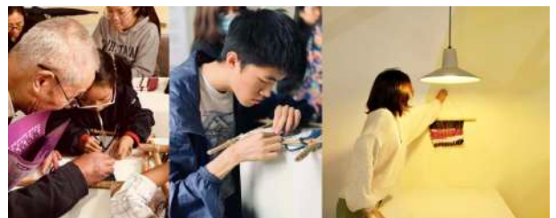
Waste Recycle/Upcycle Workshop