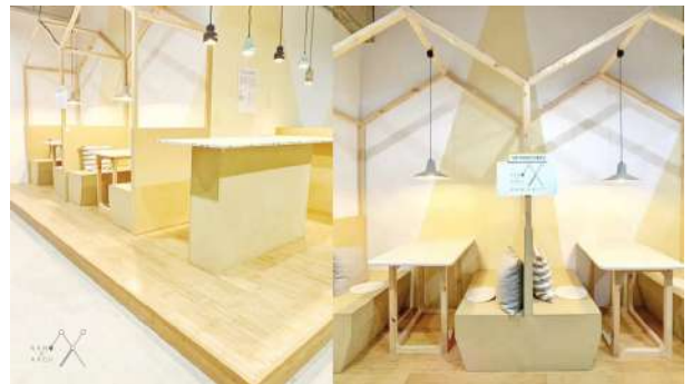
China's first-known public space made from 100% waste materials