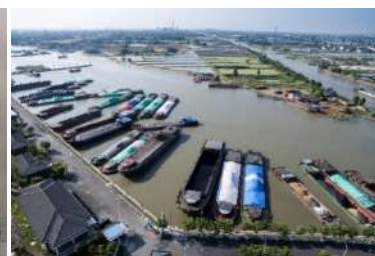
After shore power: visibly improved air quality in Luhudang offshore services area