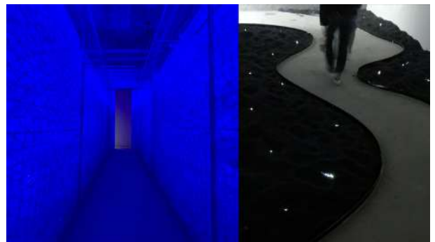
NXA Plastic Art Installation