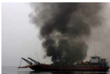
Before shore power: berthed vessels generate power from diesel, leading to air pollution

For the environment: the shore power of Luhudang will reduce fuel consumption by about 13.7 tons per annum, greatly reducing an array of pollutants (0.6 tons of sulfur oxides, 0.4 tons of nitrogen oxides, 0.2 tons of particulate pollutants, and 167,000 cubic meters of total smoke exhaust), improving the environment of the service area and the surrounding towns.